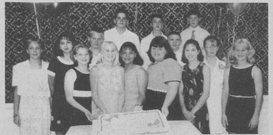
St. Mary's 8th grade graduates